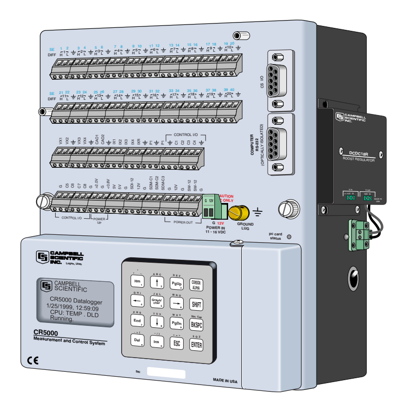
Figure 3. DCDC18R on CR5000

The DCDC18R is installed near the datalogger, either on the side of the datalogger (Figure 3) or to the back panel of the enclosure. The voltage input is connected to 12 volts and ground from the supply source. The leads from "V out" go to the charging input. The G lead from "V out" connects to either charge input terminal and the 18 V lead connects to the other. The polarity of the inputs does not matter.