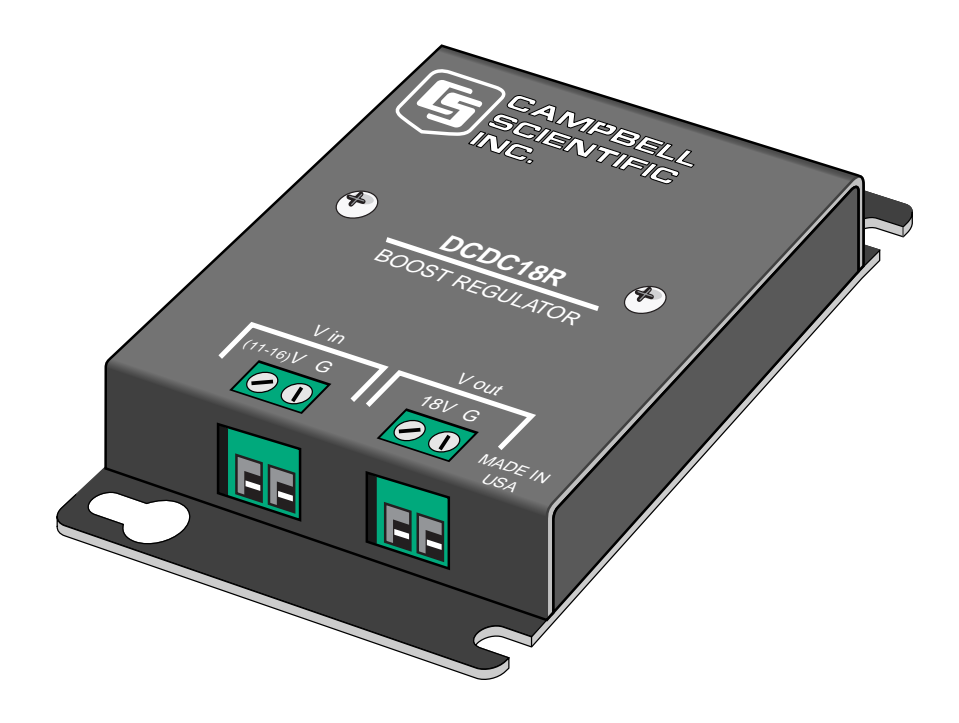
Figure 1. DCDC18R